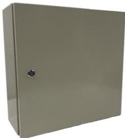
Double-bit cam lock type