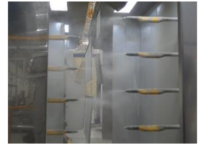
Paint plant (inside)