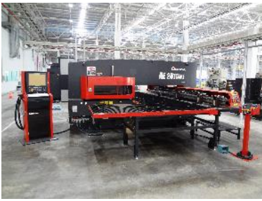
Turret punch presses