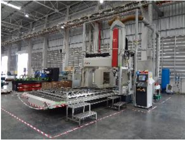
3D Laser machine