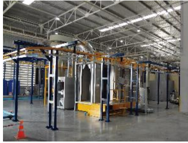
Paint plant (powder)